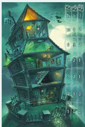
1 game board